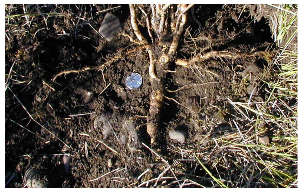
Figure 2. The roots of Dalmatian toadflax showing the top part of the thick taproot and lateral rhizomes running left and right.

Roots. Dalmatian toadflax can produce deep taproots and thick creeping rhizomes that are nearly white in color. Underground adventitious buds on the root and root crown of a well-established plant can generate reproductively viable 'daughter' stems. Vegetative regeneration from buds on root crowns and lateral roots partly explains the competitiveness of Dalmatian toadflax. Energy stored in the roots allows shoots to grow regardless of competition from a healthy plant community. Root energy reserves are greatest in the fall and lowest pre-bloom in June.