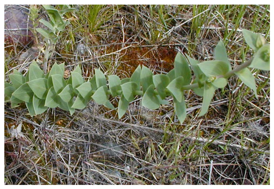
Figure 3. A Dalmatian toadflax stem showing the heart-shaped, hairless, clasping leaves and the waxy surface.

Flowers. Under field conditions, Dalmatian toadflax apparently requires both a winter dormancy period and exposure to temperatures between 50° and 68° F (10° to 20° C) to initiate flowering, which may explain its northerly geographic distribution. Because it is a short-lived perennial with individual plants living an average of three to five years, seed production is important to stand survival. Flowering begins in June and can continue through September and into November under ideal conditions. The flowers are bright yellow with an orange center, are shaped similar to the blossoms on snapdragon, have a distinct spur at the base, and are relatively widely spaced on spike-like racemes (see Figure 4). The racemes form at the growing tip of the primary stem and secondary flowering stems can grow from buds in the leaf axils which gives the plant a branched appearance. Flowering is indeterminate; blooming occurs from the base of the stem toward the elongating stem tip and new flowers are produced as long as conditions are favorable. Stems can grow to over three feet (one meter) tall. Starting in July, flowers develop into cylindrical capsules that may contain 40 or more seeds. Stems die when soil moisture is depleted or in freezing temperatures. However, once dead, the stout stems can remain upright and disperse seeds throughout the winter.