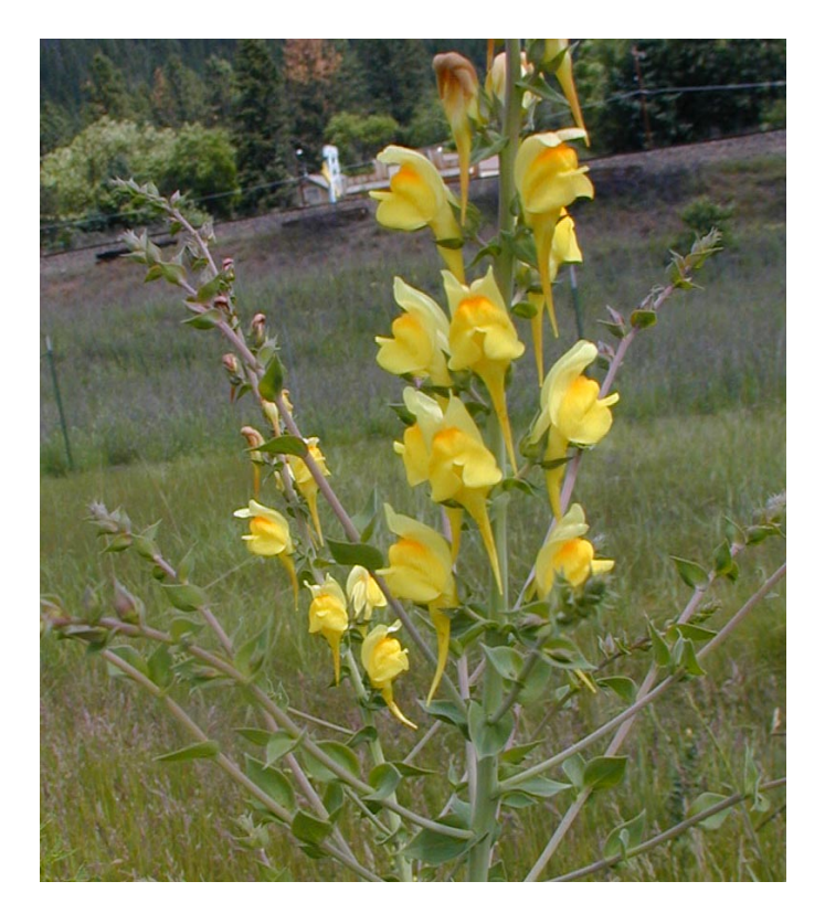
Figure 4. Dalmatian toadflax flowers showing the snapdragon-like shape, prominent spur at the base of the flower, and branching at the leaf axils.

Spread. In cases other than intentional horticultural plantings, spread of Dalmatian toadflax occurs predominantly through seed dispersal. Most seeds fall within five feet (1.5 m) of the parent plant. Dalmatian toadflax seeds are small (about the size of an alfalfa seed) with a papery wing that may facilitate wind dispersal. Long-distance wind dispersal has been suggested during the winter when seeds fall from upright stems onto crusted snow. Birds, other wildlife, and domestic animals that consume the seed capsules may disperse seeds long distances when undigested, viable seeds pass through their digestive tracts. Population expansion is achieved through short-distance seed dispersal and by vegetative propagation from creeping roots. On cultivated land, root fragments clinging to farm implements can initiate new infestations.