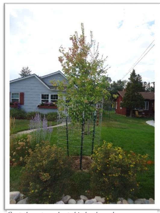
Cost-share tree planted in boulevard