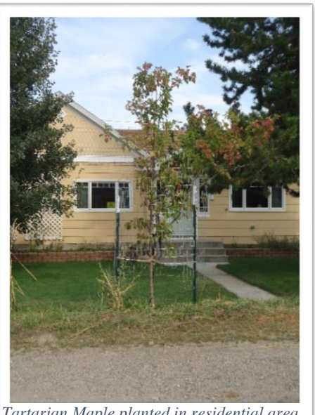
Tartarian Maple planted in residential area

Trees were planted by a local contractor, Mike Taylor, on a per-tree fee basis of $100/tree. The contractor was responsible requesting utility locates, determining planting site, suggesting tree species and planting the tree (including mulch, T-posts, fencing and tie-straps). The property owner is required to maintain the tree from that point forward, including watering and pruning - as required by existing tree ordinance.