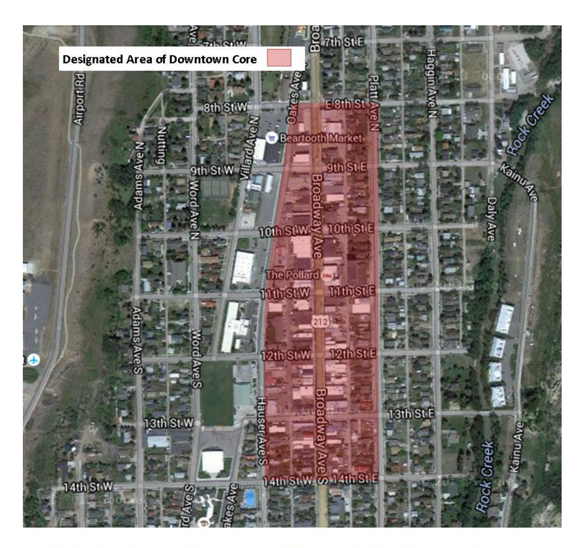
The shading shown on this map is a graphic representation of the general area often to referred to as our business area; and may be reflected differently as economic development patterns and opportunity change from time to time.